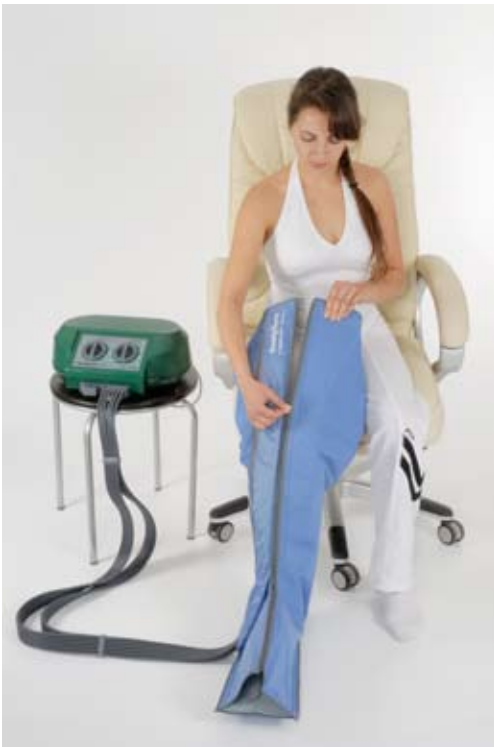
Closing zipper on Comfy Leg Sleeve®