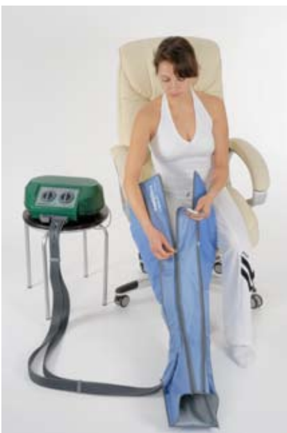
Comfy Leg Sleeve® with Tapered Expander