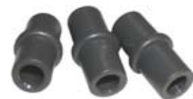
Round double-sided plugs