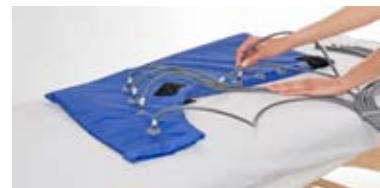
connecting hoses to valves