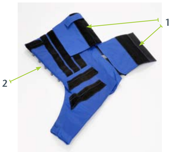
Expanders (1) fitted to FL® Velcro Sleeve (2)