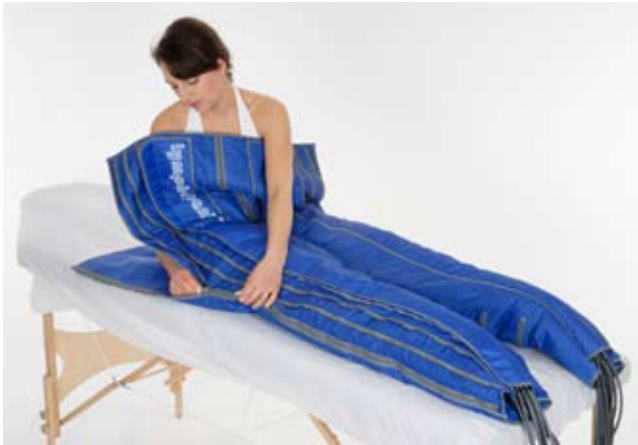
Closing the zipper on Lympha Pants®