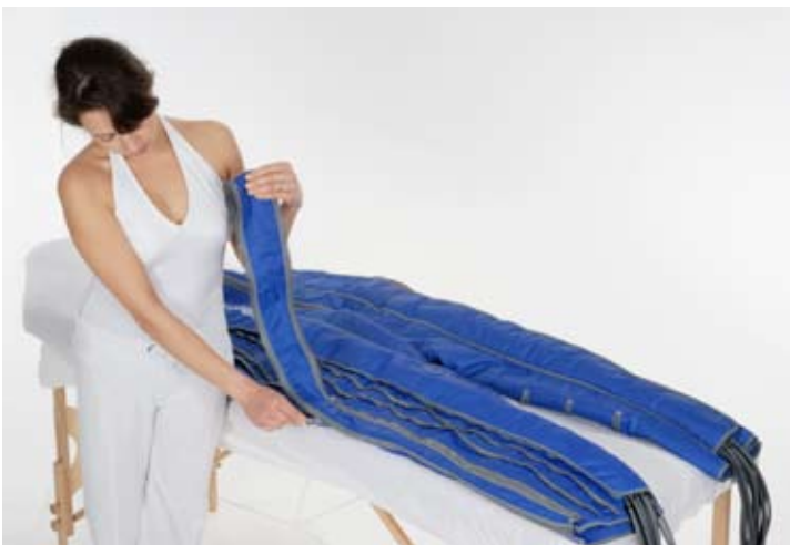
Adding an expander to Lympha Pants®