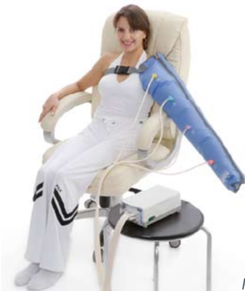
Phlebo Press® Arm Sleeve